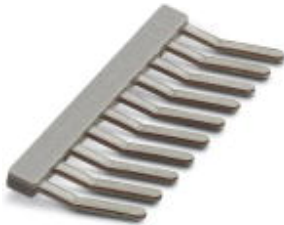
Insertion bridge, Pitch: 5 mm, Number of positions: 10, Color: gray

Please be informed that the data shown in this PDF Document is generated from our Online Catalog. Please find the complete data in the user's documentation. Our General Terms of Use for Downloads are valid ( http://phoenixcontact.com/download )