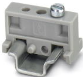
End clamp, width: 6.2 mm, color: gray

Please be informed that the data shown in this PDF Document is generated from our Online Catalog. Please find the complete data in the user's documentation. Our General Terms of Use for Downloads are valid ( http://phoenixcontact.com/download )