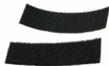
Hook & Loop Mounting Strip 1592ETV