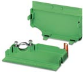
Cable housing, Pitch: 0 mm, Number of positions: 24, Dimension a: 120 mm, Color: green

Please be informed that the data shown in this PDF Document is generated from our Online Catalog. Please find the complete data in the user's documentation. Our General Terms of Use for Downloads are valid ( http://phoenixcontact.com/download )