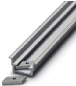
Slide nut, for DIN rail NS 35/15-AL, with M 6 thread, for mounting equipment, material: Steel

Please be informed that the data shown in this PDF Document is generated from our Online Catalog. Please find the complete data in the user's documentation. Our General Terms of Use for Downloads are valid ( http://phoenixcontact.com/download )