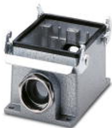
Box mounting base, with double locking latch, height 72 mm, with screw connection, 1x Pg29

Please be informed that the data shown in this PDF Document is generated from our Online Catalog. Please find the complete data in the user's documentation. Our General Terms of Use for Downloads are valid ( http://phoenixcontact.com/download )