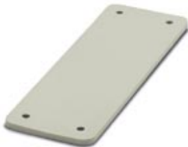
HEAVYCON cover plate, for panel cutouts of type B16/HV6, 3.5 mm thick, gray

Please be informed that the data shown in this PDF Document is generated from our Online Catalog. Please find the complete data in the user's documentation. Our General Terms of Use for Downloads are valid ( http://phoenixcontact.com/download )