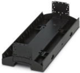
Installation component housing, length: 89.7 mm, Lower part

Please be informed that the data shown in this PDF Document is generated from our Online Catalog. Please find the complete data in the user's documentation. Our General Terms of Use for Downloads are valid ( http://phoenixcontact.com/download )