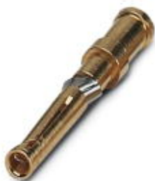
Turned 1.6 crimp contact, individual female contact, core diameter 0.5 mm 2 , gold-plated

Please be informed that the data shown in this PDF Document is generated from our Online Catalog. Please find the complete data in the user's documentation. Our General Terms of Use for Downloads are valid ( http://phoenixcontact.com/download )