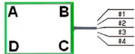
Origin (0,0) Point